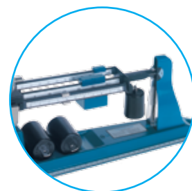
Mass holders offer handy storage for additional weights.