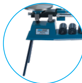
Tripod legs and integral weigh-below hook make density experiments convenient and easy.